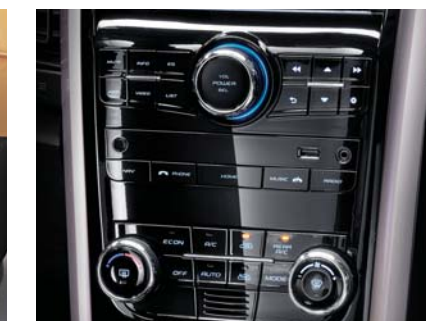
PIANO BLACK CENTRE CONSOLE