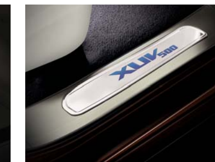
ILLUMINATED SCUFF PLATES