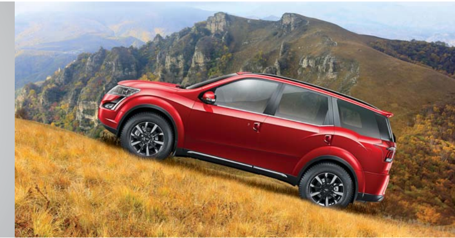
HILL DESCENT & HILL HOLD CONTROL