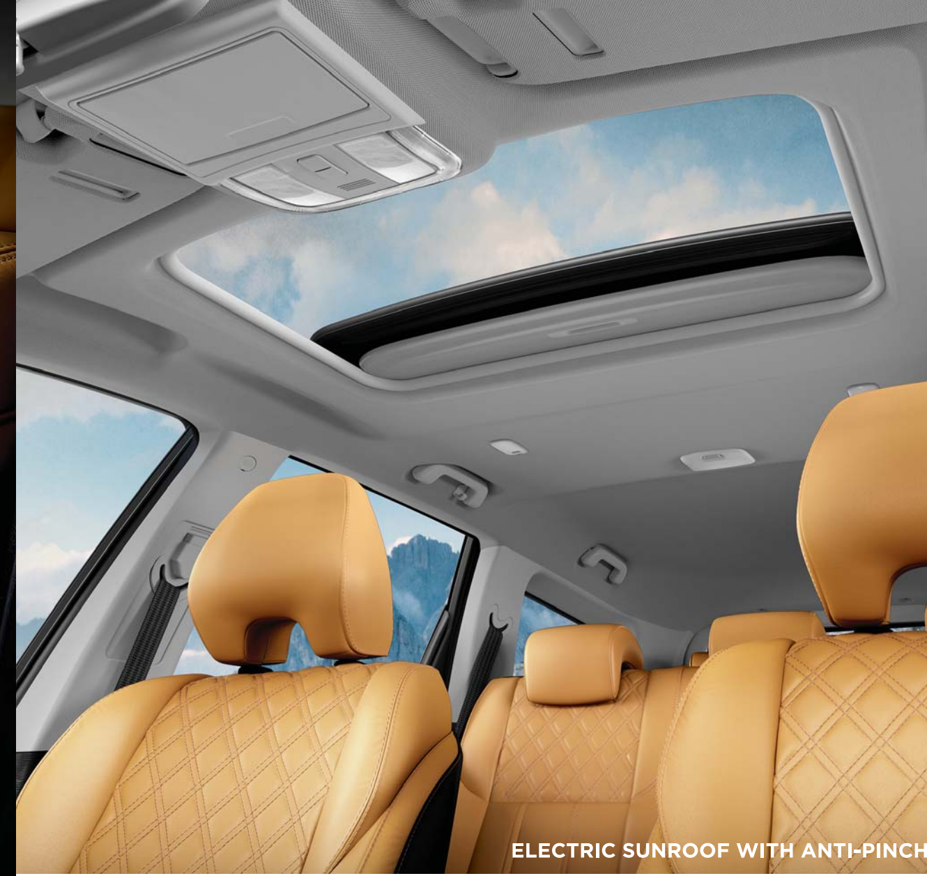
ELECTRIC SUNROOF WITH ANTI-PINCH

Step inside the new XUV500 and you can't help but feel pampered. The immaculate, soft-touch leather craftsmanship with fine stitch lines and piano black centre console add a dash of elegance to the dashboard. And the quilted, tan leather seats further accentuate this feeling of sophistication. But that's not all, look up and you will find the stunning electric sunroof with anti-pinch. Finally, the reduced noise levels, resulting in a much quieter in-cabin experience, ensures that even the most remote adventures, feel nothing short of 5-star extravagance.