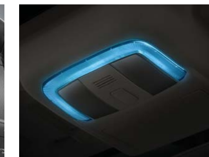
ICY-BLUE LOUNGE LIGHTING