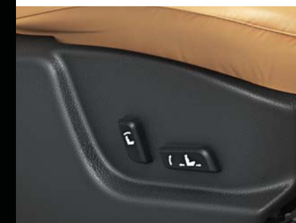
6-WAY POWER-ADJUSTABLE DRIVER'S SEAT

LUXURIOUS, SOFT-TOUCH, LEATHER DASHBOARD The dashboard and door trims have been fashioned with soft-touch, faux leather with fine stitch lines, elevating the interior's fit and finish by a few notches.