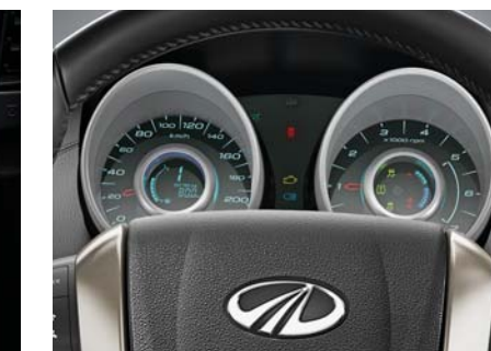
SPORTY TWIN POD CLUSTER