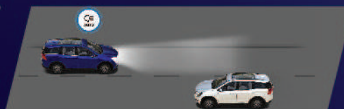
HIGH BEAM ASSIST