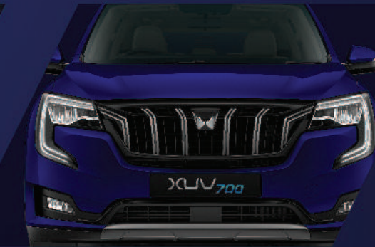
STRIKING CLEAR-VIEW LED HEADLAMPS WITH DRL AND SEQUENTIAL TURN INDICATOR