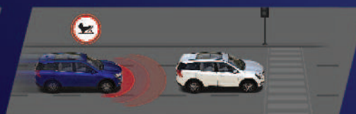
AUTOMATIC EMERGENCY BRAKING