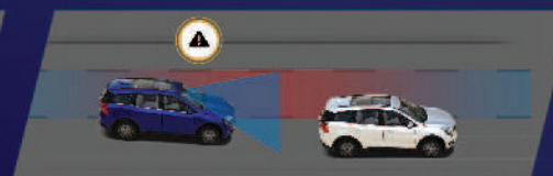
LANE KEEP ASSIST