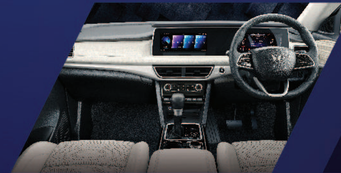
LUXURIOUS AND SOPHISTICATED INTERIORS

With the expansive Skyroof™ in the Mahindra XUV700, panoramic views are the new default. Blazing sunsets or sparkling city lights. Now bring your love for the outside, inside with every drive.