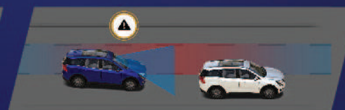
LANE DEPARTURE WARNING