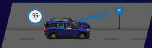
TRAFFIC SIGN RECOGNITION