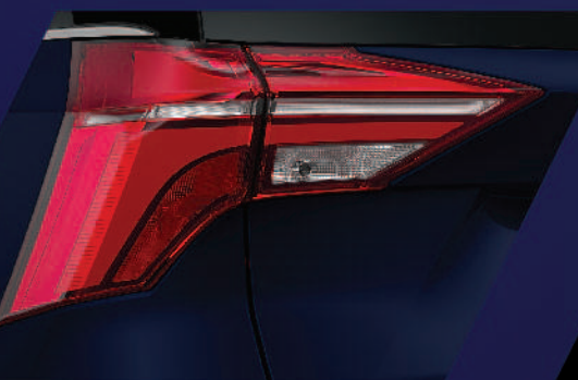
CAPTIVATING ARROW-HEAD LED TAILLAMPS