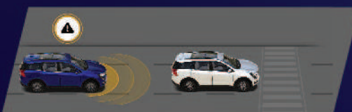
FORWARD COLLISION WARNING