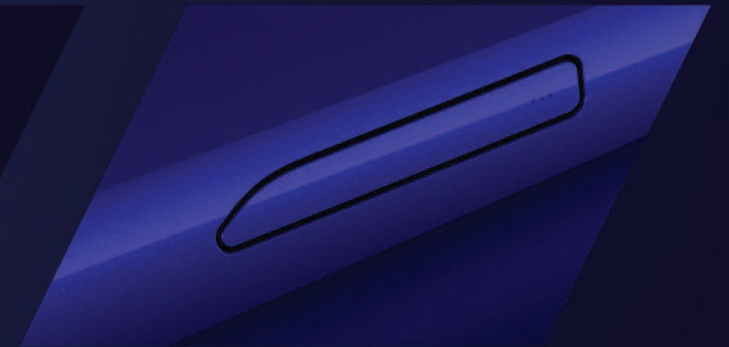
SMART DOOR HANDLES