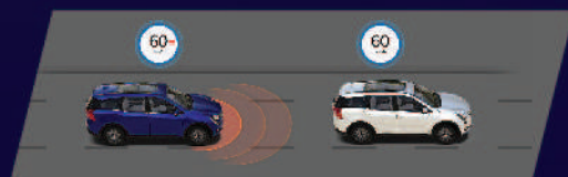
ADAPTIVE CRUISE CONTROL