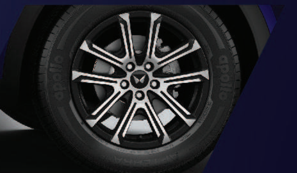
R18 DIAMOND-CUT ALLOY WHEELS