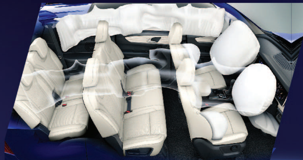
BEST-IN-CLASS 7 AIRBAG SAFETY