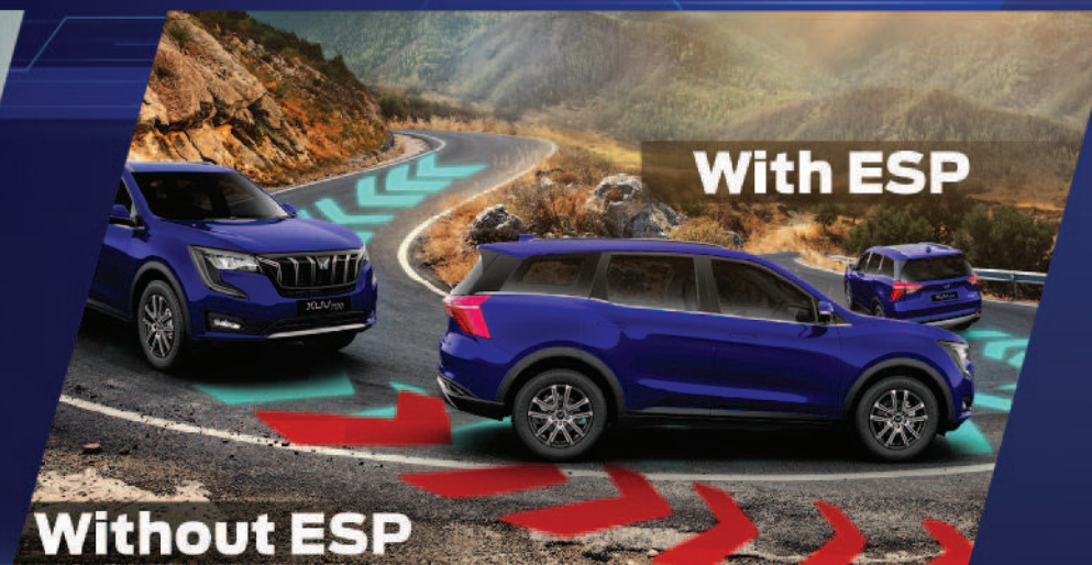
LATEST-GEN ELECTRONIC STABILITY PROGRAM