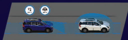
SMART PILOT ASSIST